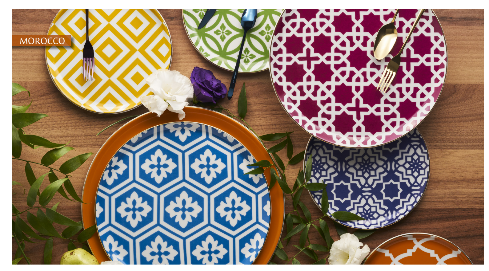
Morocco: Eccentric and vivid colors combined with traditional textures create Morocco. Style that reflects the mystical soul of the Orient's bright colors, patterns, and gold detail.