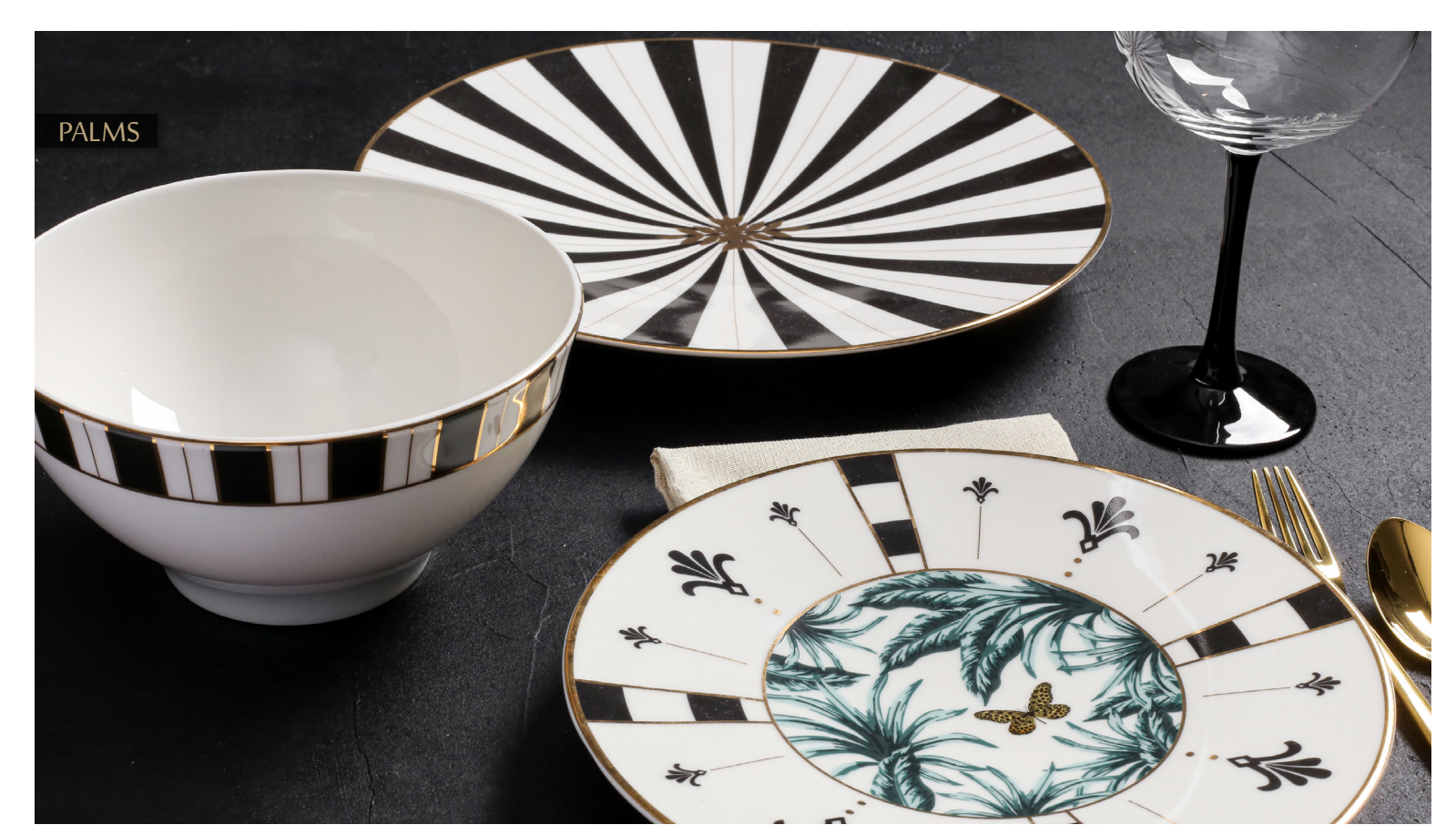
Palms: Art Deco Reflected on the Table... the Palms Collection combines beautiful rich palm leaves with dramatic art deco geometrics. The collection is made from a proprietary Alumilite porcelain formula that gives the dinnerware high mechanical strength, while maintaining a slim and lightweight profile.