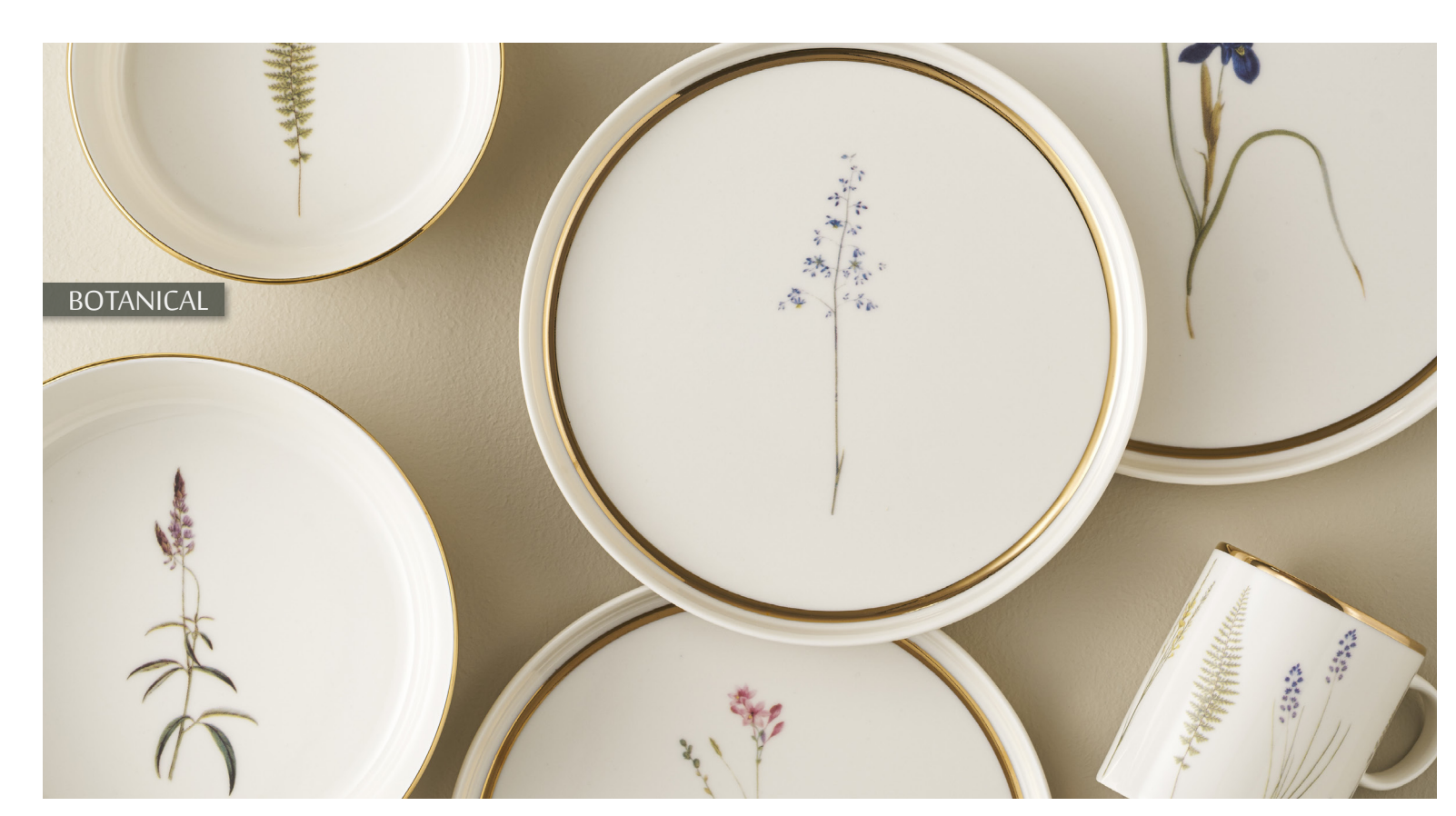
Botanical: Origin of Nature: Botanical is an exquisite collection bringing wildflowers of the countryside to life. The wild iris, lavender and butterfly bush patterns provide a feast of nature on your dinner tables.